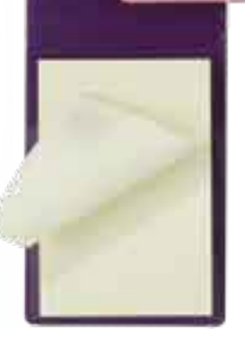
Small sticky note holder