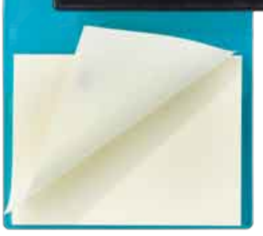
Large sticky note holder