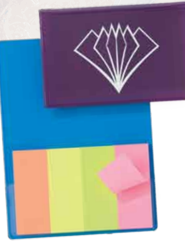
Neon sticky flag booklet